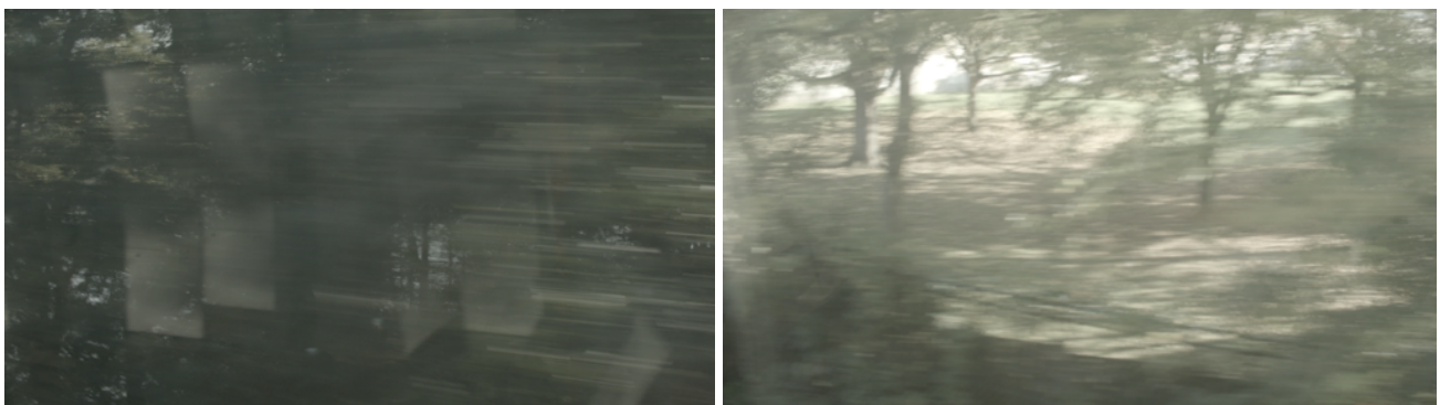
Footages of train journeys as a potential metaphor of the progress of reinventing identity in the film

The essay film would document interviews with people working on Hong Kong's colonial archive, alongside with my own narrative in the form of voice-over on my own experience with the content and form of these material. Visually it would show the materiality of the archive as a physical form of memory, and the process of it being transmitted to a digital device, as a metaphor of transformation and transference of memories.